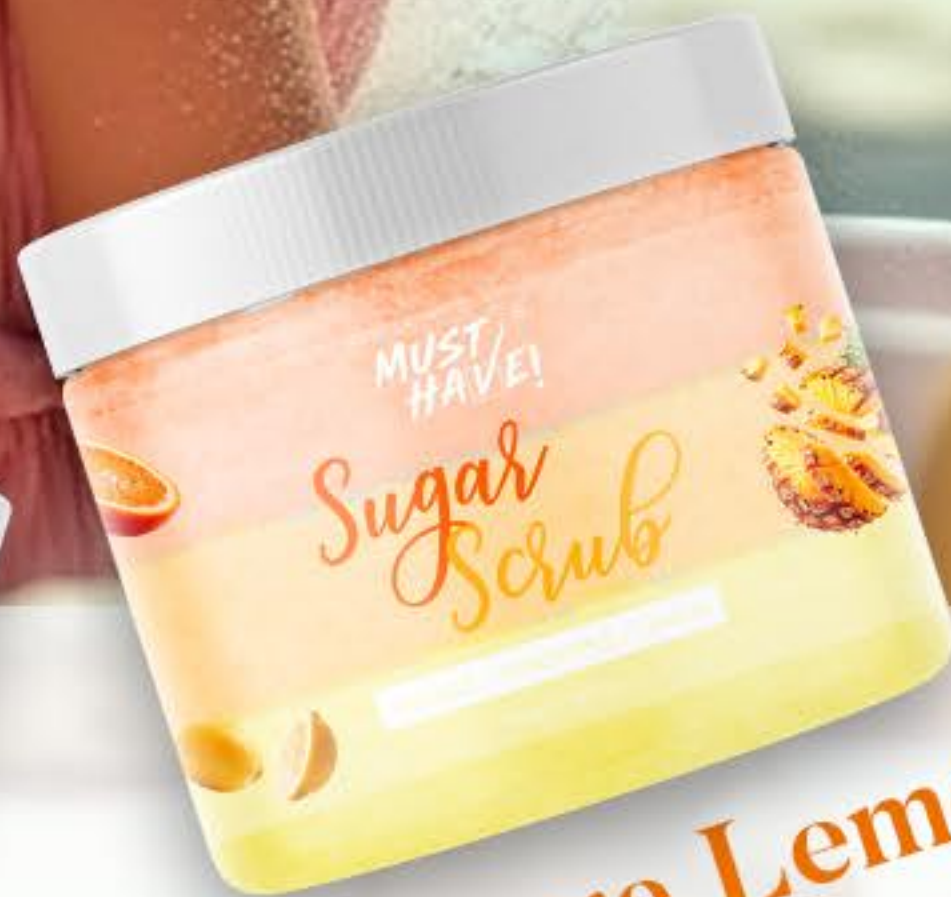
Orange Lemon Pineapple